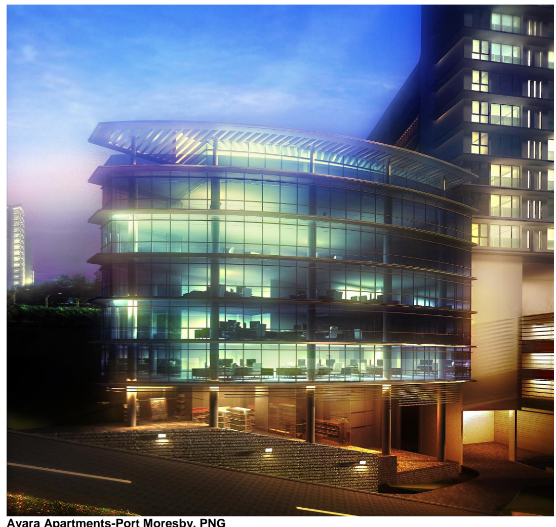
Avara Apartments-Port Moresby, PNG

Kramer Ausenco conducts its affairs in accordance with a set of operating procedures referred to as the Kramer Ausenco Business System. This system has been third party certified to conform to the requirements of AS/NZS ISO 9001.