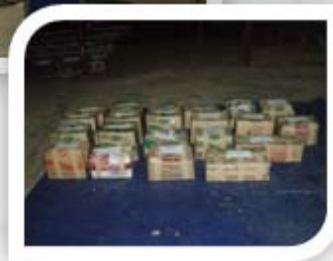
19 cartons of food parcels were donated by KA Fiji Office