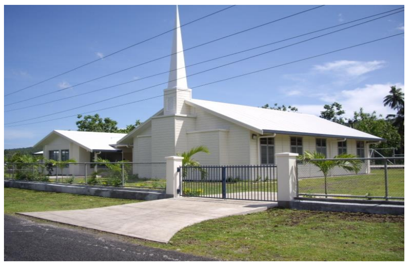
LDS Falelima Meeting House- Samoa

Kramer Ausenco conducts its affairs in accordance with a set of operating procedures referred to as the Kramer Ausenco Business System. This system has been third party certified to conform to the requirements of AS/NZS ISO 9001.