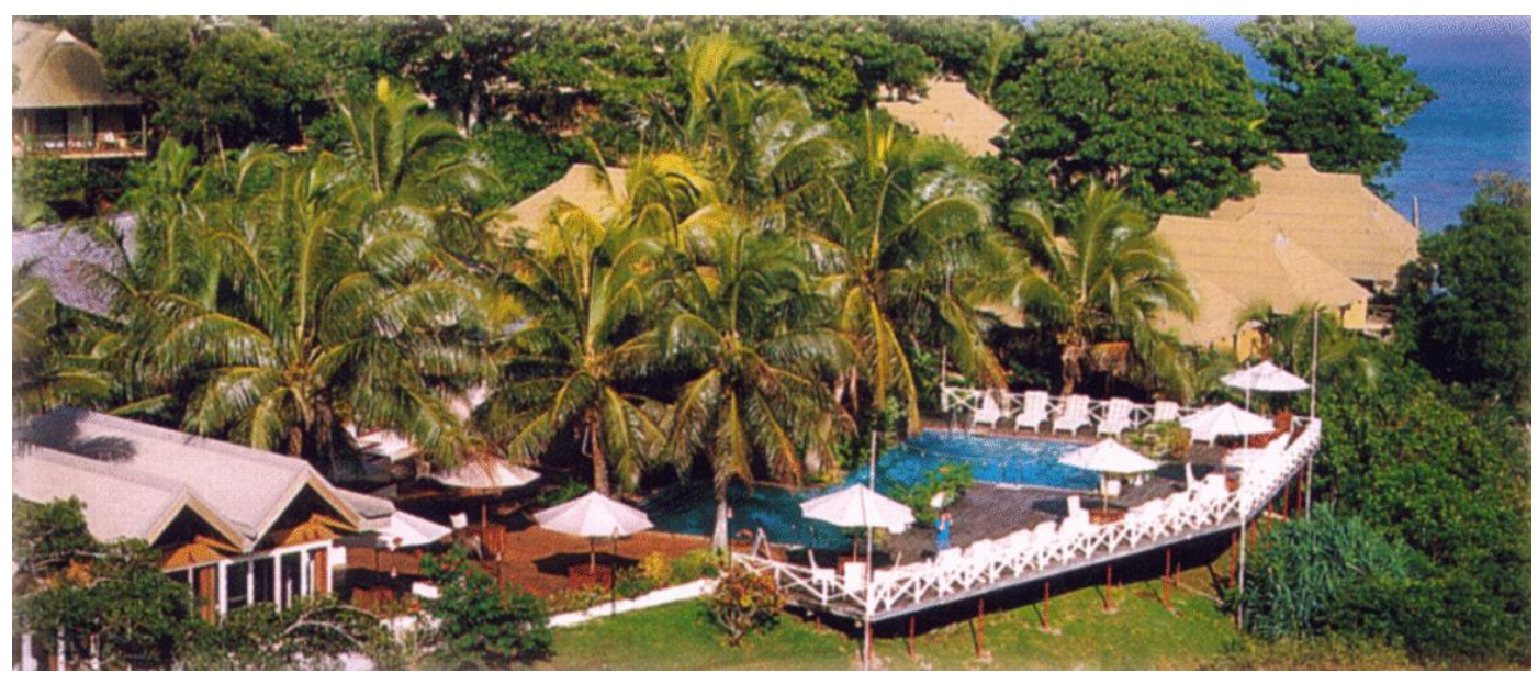
Iririki Resort- Vanuatu

Kramer Ausenco conducts its affairs in accordance with a set of operating procedures referred to as the Kramer Ausenco Business System. This system has been third party certified to conform to the requirements of AS/NZS ISO 9001.