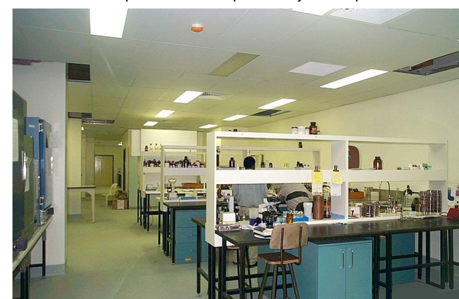
Central Public Health Laboratory, PNG

All necessary briefing and interpretive skills are available inhouse where professional engineers subcontract the detailed requirements to specialist firms whose capabilities are well known and highly regarded.