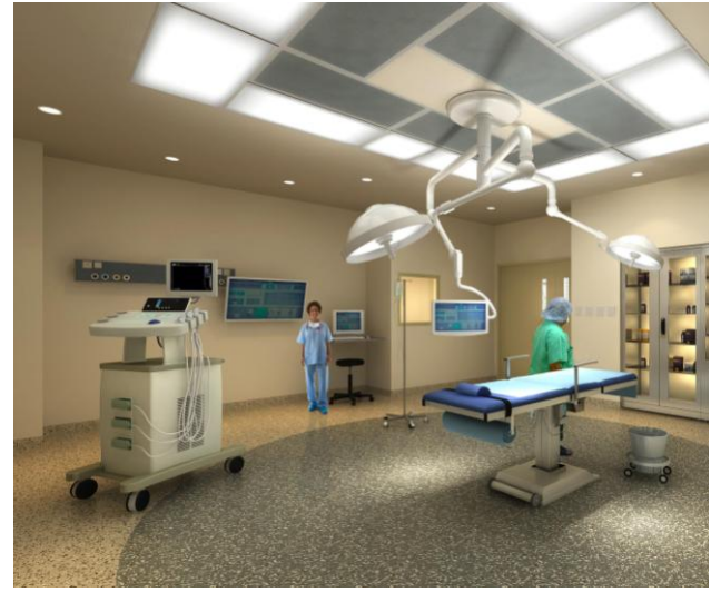
Pacific International Private Hospital, PNG

Kramer Ausenco operate under a Project Management framework developed and used over the years to suit local conditions in the region to ensure successful completion of projects on time and within budget.